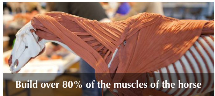
Build over 80% of the muscles of the horse